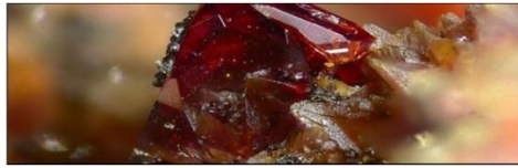
Figure 10. Mineral Lorandite from the Alshar mine near the village of Rozen.

Alshar mine is located (40 km) south of Kavadarci, near the village of Rozhen near Majdanska Reka and is unique in many things in the world. Alshar has recorded dozens of minerals so far, of which only seven are in Macedonia. In (250,000 tons) ore contain 2% arsenic, 2,5% antimony and 0,1% thallium, making the mine the richest and only thallium site in the world, used for space exploration and telecommunication technologies. A special and most important rarity in Alshar is the lorandite, a thallium mineral.