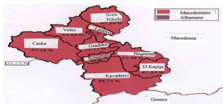
Figure 1. Geographical position of the Vardar region in the Republic of Macedonia.

The Vardar region covers the central part of the Republic of Macedonia and extends along the Vardar River and the Ovche Pole valley. According to the data from 2016, this region has the smallest number of inhabitants, or 7.4% of the total population. It extends to 16.2% of the territory of the Republic of Macedonia and at the same time is the least populated region with only 37.8 inhabitants per 1 km 2 .