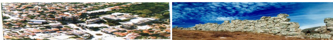
Picture 11. Panorama of the city of Sveti Nikole (from left to right), devil wall.

Sveti Nikole is a city that can attract a large number of tourists to the famous Devil's Wall and Gradishte - Bil Zora.