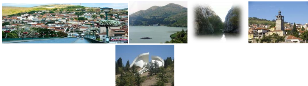
Figure 2. Panorama of the city of Veles, Veles Lake (from left to right), the course of the river Babuna through the gorge, the City Clock in Veles, the Memorial Oasis in Veles.

Beside him, the sites Breza and Pešti, which are abundant with caves with archaeological remains of the Neolithic, early Christian caves, are also significant. Attraction for the tourists was also the Memorial Kosturnica which is located above the entrance to Veles and the City Clock in the very center of the city. Also, as the main attraction for the visitors, Veles is the lake.