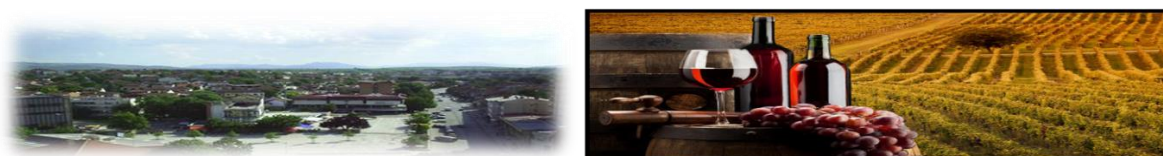
Figure 7. Panorama of the city of Negotino (from left to right) and the wine region of the Negotino region.