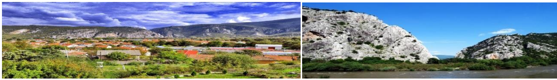
Picture 8. Panorama of the city Demir Kapija (from left to right), Demir Kapija gorge.