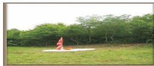
Figure 5. The point that marks the center of the Republic of Macedonia in the municipality of Caska.

The municipality of Caska is located in the central part of the Republic of Macedonia. It covers an area of 825 km 2 , and is among the three largest municipalities in Macedonia. Neighboring municipalities bordering on them are Veles and Gradsko in the east, Zelenikovo and Studenicani to the north, Makedonski Brod and Dolneni to the west and Prilep and Kavadarci to the south. The municipality is characterized by a very complex relief, composed of several morphological and tectonic units. The area is predominantly hilly - lowland, except the part where the massif is on the mountain Jakupica, which is very mountainous. The massif of the mountain Jakupica is composed of the five interconnected mountains: Jakupica, Dautica, Karadzica, Golesnica and Kitka. At the height of (300 meters above sea level), in the locality of Deep Dol, near the village of Dolno Vranovci in the Municipality of Caska, the center of Macedonia is marked.